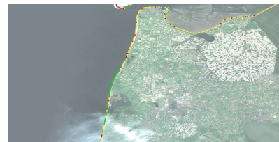
Accreting shoreline resulting from extensive sand nourishment (western Netherlands)